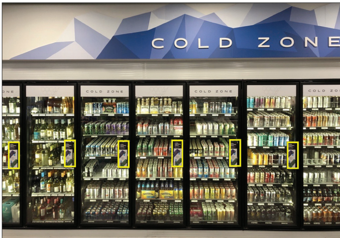
COLD ZONE FEATURE ARTICLE VEDETTE DE NOTRE ZONE FROIDE

Inventory levels will be determined by MBLL and enough inventory will be maintained for the program period to support a visually effective display.